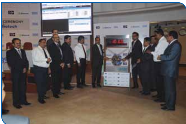
THE MOMENT OF GLORY!!